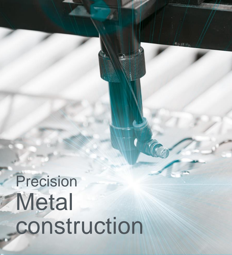
Precision Metal construction