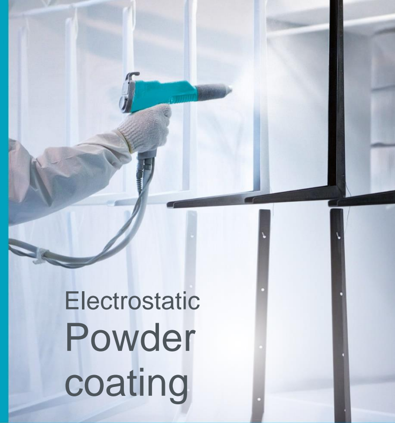
Electrostatic Powder coating